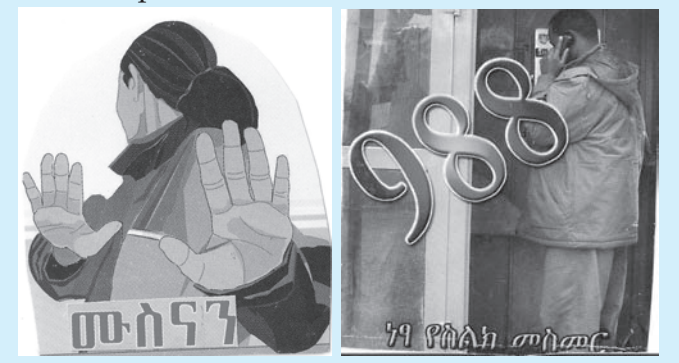
Picture 2.4. Combating corruption is the duty of every society (source Federal Ethical and anti-corruption commission)

Answer the following questions on basis of the picture above.